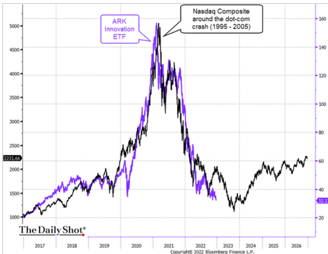
ARKK vs Nasdaq

The second chart is a reminder that the Nasdaq bounced markedly several times during the dot com drawdown, with each successive time bringing cheers of "this is the bottom". Valuations take a long time to normalize, and with history as our guide, we prefer to think we have seen this movie before and can skip the scary parts.