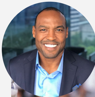
Darren Woodson Keynote speaker

What are the cultural differences between mediocre teams and winning teams, whether they are in sports or business? In this speech, Darren Woodson (5 time Pro Bowl safety and 3 time NFL Super Bowl Champion with the Dallas Cowboys) describes what leaders must embrace in order to build a culture of excellence with their teams. Learn how to embrace change, competition, and confrontation within your organization.