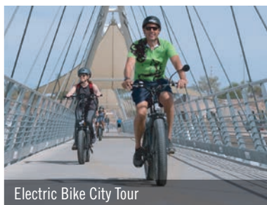
Electric Bike City Tour