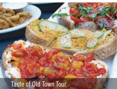
Taste of Old Town Tour

Looking to relax and get pampered? This excursion choice is for you. Location is still TBD, but you can expect it will be at a luxurious resort in the Scottsdale area. Transportation included if offsite. Guests on this excursion will have the choice of a 60 min massage, facial or manicure and pedicure treatment. Guests will be able to use the spa facilities before and after treatment.