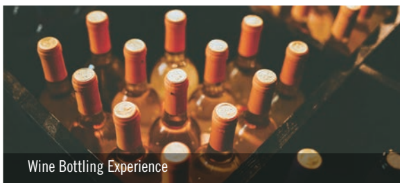
Wine Bottling Experience