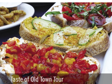
Taste of Old Town Tour

Looking to relax and get pampered? This excursion choice is for you. Location is still TBD, but you can expect it will be at a luxurious resort in the Scottsdale area. Transportation included if off-site. Guests on this excursion will have the choice of a 60 min massage, facial or manicure and pedicure treatment. Guests will be able to use the spa facilities before and after treatment.