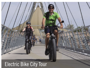
Electric Bike City Tour