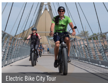
Electric Bike City Tour