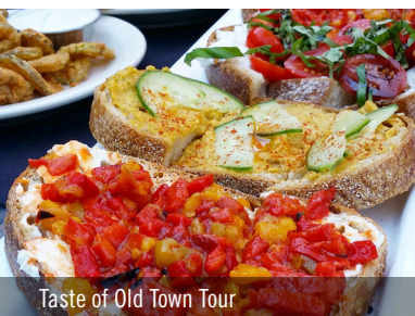
Taste of Old Town Tour

Looking to relax and get pampered? This excursion choice is for you. Location is still TBD, but you can expect it will be at a luxurious resort in the Scottsdale area. Transportation included if offsite. Guests on this excursion will have the choice of a 60 min massage, facial or manicure and pedicure treatment. Guests will be able to use the spa facilities before and after treatment.