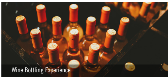
Wine Bottling Experience