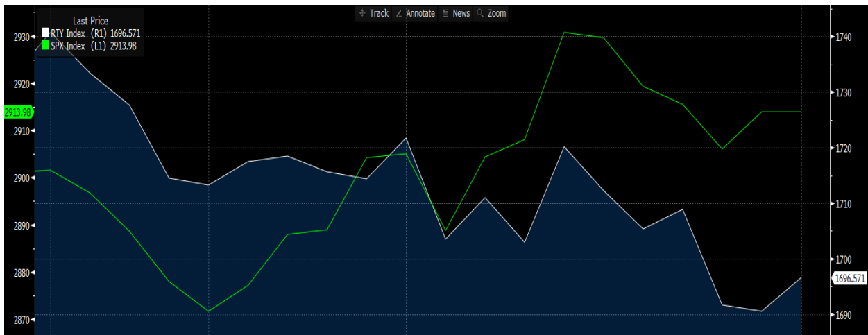
Charts courtesy of Bloomberg

Similar market action occurred last September of 2018, which preceded market volatility in the 4 th quarter.